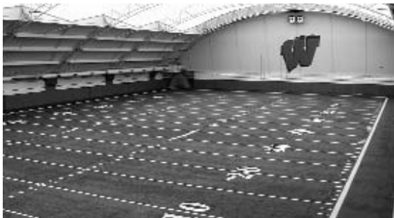
The McClain Center, which features an 80-yard indoor field, is an excellent training facility for both running and throwing.

Free parking is available in lot 17, the ramp north of Camp Randall Stadium, or on the street.