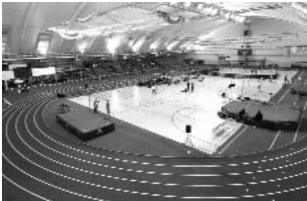
The Camp Randall Memorial Sports Center (The Shell) is the indoor home of the University of Wisconsin track and field teams.

Pre-registration: $55 (Deadline for pre-registration is March 2, 2009.) Registration the day of camp: $65 Coaches: $30